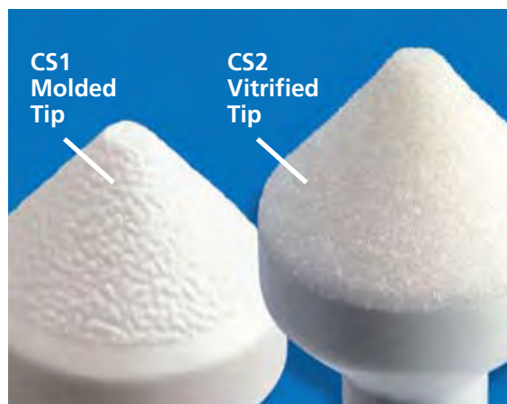
CS1 Molded Tip